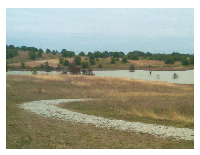
Using lakes, ponds, and tanks, rancher J. K. "Rooter" Brite, Jr., ensures water availability for his livestock and wildlife operations on the JA Ranch near Bowie, TX. Water availability is one of the 17 ranch sustainability monitoring indicators recommended by the Sustainable Rangelands Roundtable.

Forage utilization. This indicator measures annual forage use levels or residual forage in pastures on the ranch. In the short term, utilization of forages (i.e., use levels, stubble height, or residual forage across the landscape in key areas) represents the general adequacy of management of animal numbers, distribution of grazing, provision of forage for alternative species, and soil surface protection. Values will be impacted by slope, water, and presence of shrubs. Possible techniques to estimate forage utilization include the Livestock Utilization Landscape Appearance Method,<sup>12</sup>