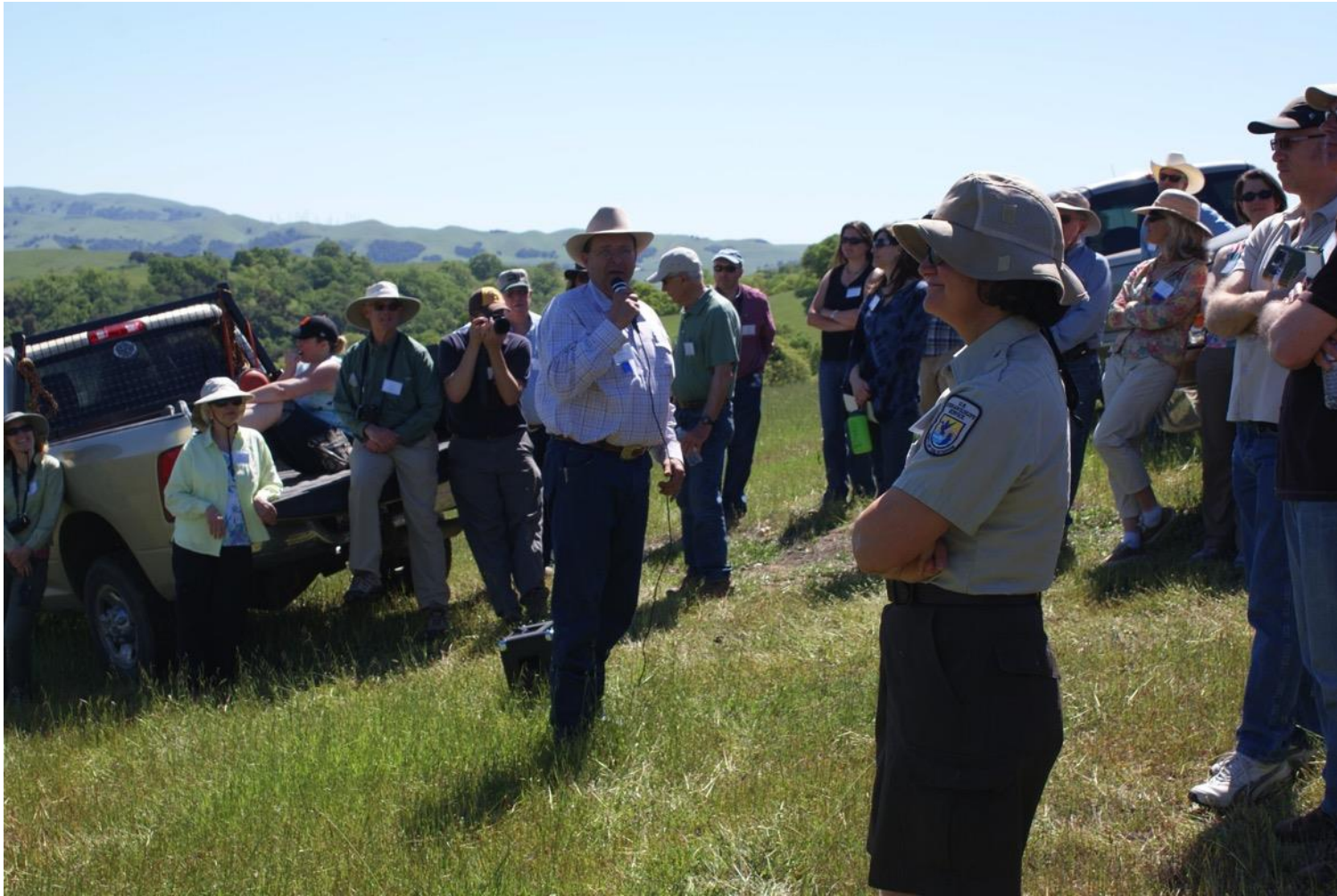
Koopmann Ranch – California 2012 LCA recipient